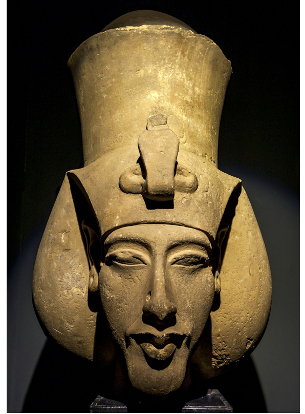
Statue of Akhenaten.