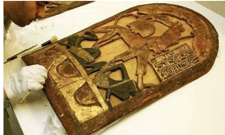
A piece of King Tut's armor.