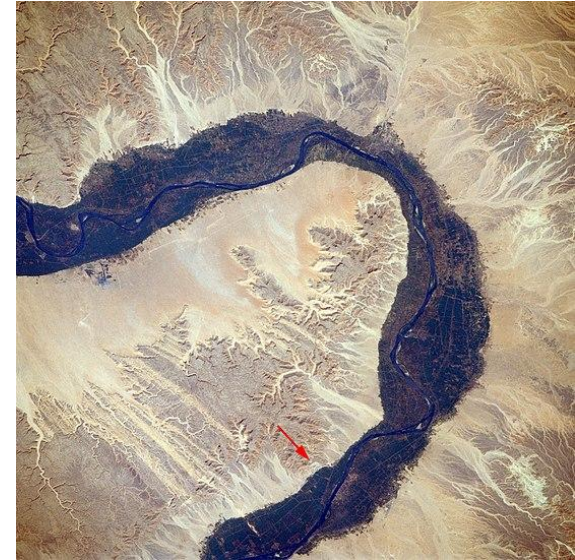
Location of the Valley of Kings.