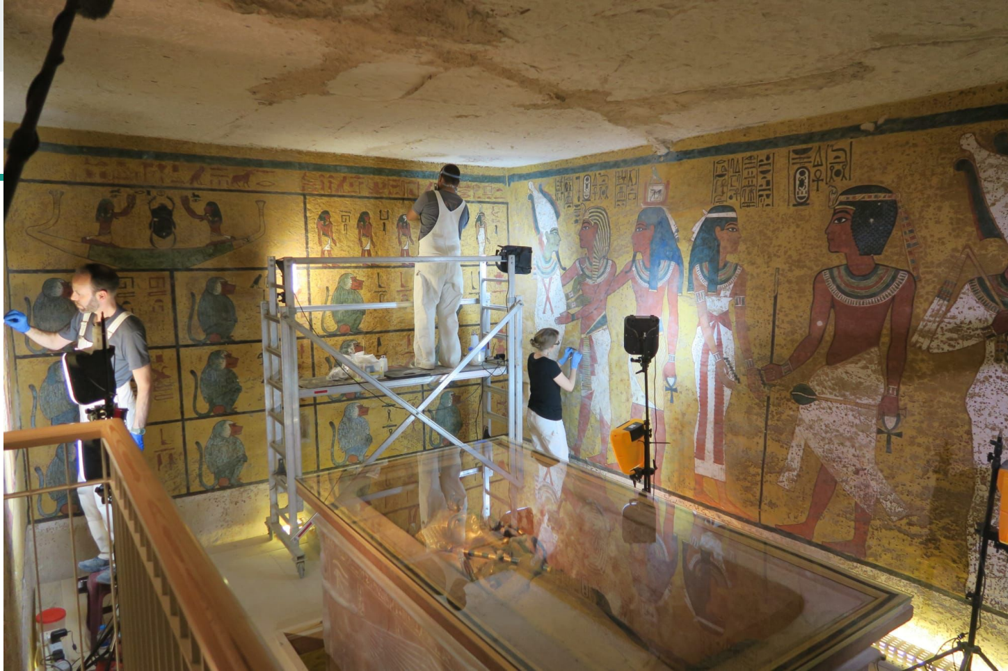
Restoration work on the walls of Tut's tomb.