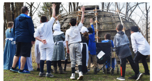
HHS education program on Esopus Munsee wigwam.

The HHS Education website: https://www.huguenotstreet.org/programs-events .