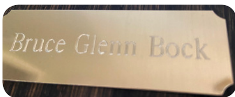
Recent additions to Commemorative Board.